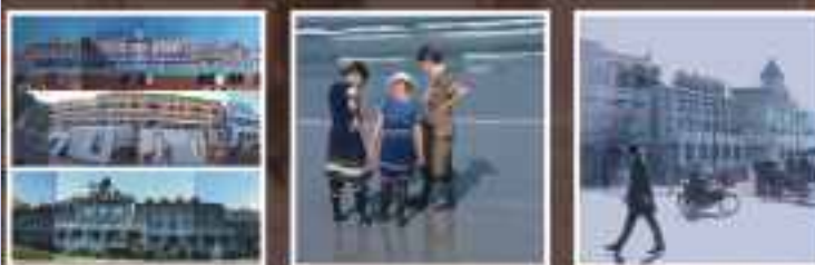
TWELVE DAYS OF TERROR