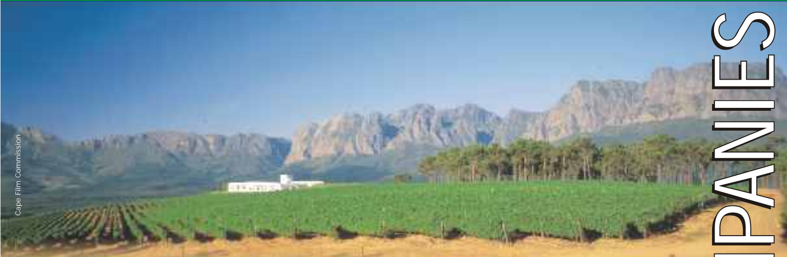
Cape Film Commission

"your service company for film and stills"